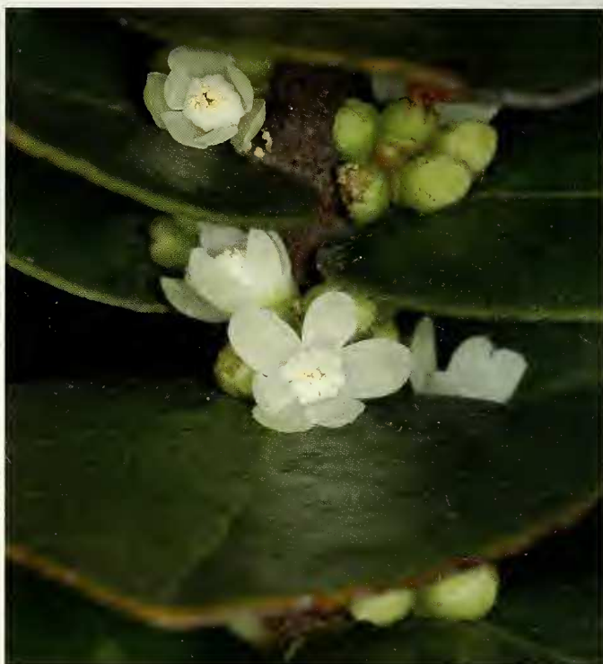
FIGURE 2. Symplocos candelabra Aranha, P.W. Fritsch, and Almeida showing a flowering branch.

DISCUSSION. — Brand (1901) described Symplocos angulata Brand based on P. Claussen 174 (K specimen only) and A.F.M. Glaziov 15189 (Minas Gerais: Serra do Caraça, Morro [Pico] do Inficionado in 14 June 1884). Bidá (1995) expanded the concept of S. angulata to include several specimens collected on Serra do Cipó, but the plants from these two areas are sufficiently dis-